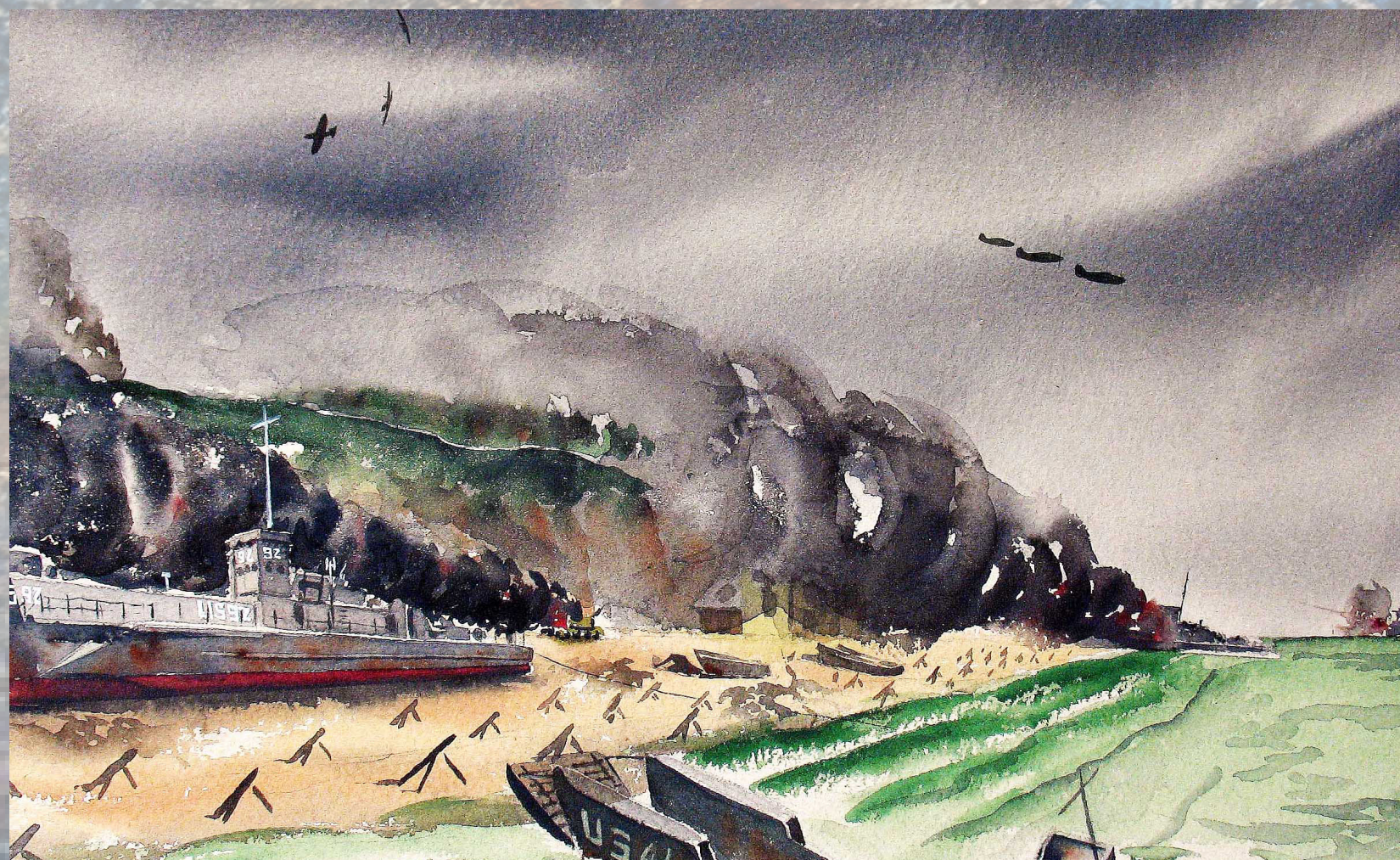
D-day H.W. Vestal, 1944 Coast Guard Combat Art' Heritage Asset Collection 1992.322